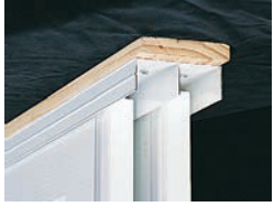
TOP TRACK Nylon guides supplied to fix top of doors to ensure smooth operation