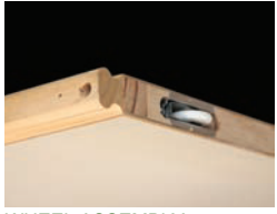
WHEEL ASSEMBLY Also pictured is timber finger grip on door edge