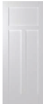
HAMPTON PAGE 26