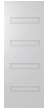
SORRENTO PAGE 29