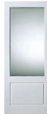
MIRROR SQUARE TOP