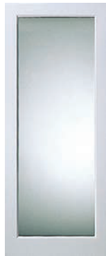
MIRROR FULL TOP