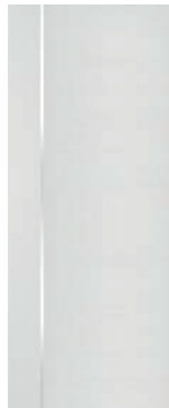
STRATA RANGE PAGE 27