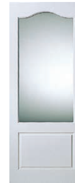
MIRROR ARCH TOP