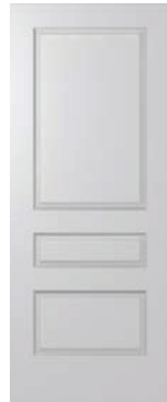
HUMECRAFT PAGE 28