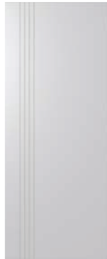
ACCENT RANGE PAGE 32