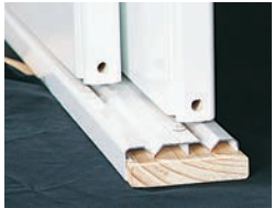
BOTTOM TRACK Easy maintenance with door height adjustment in edge of door