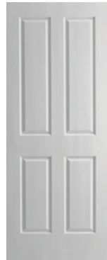
MOULDED PAGE 34-35