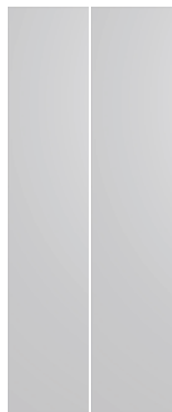
BF1 PC MDF